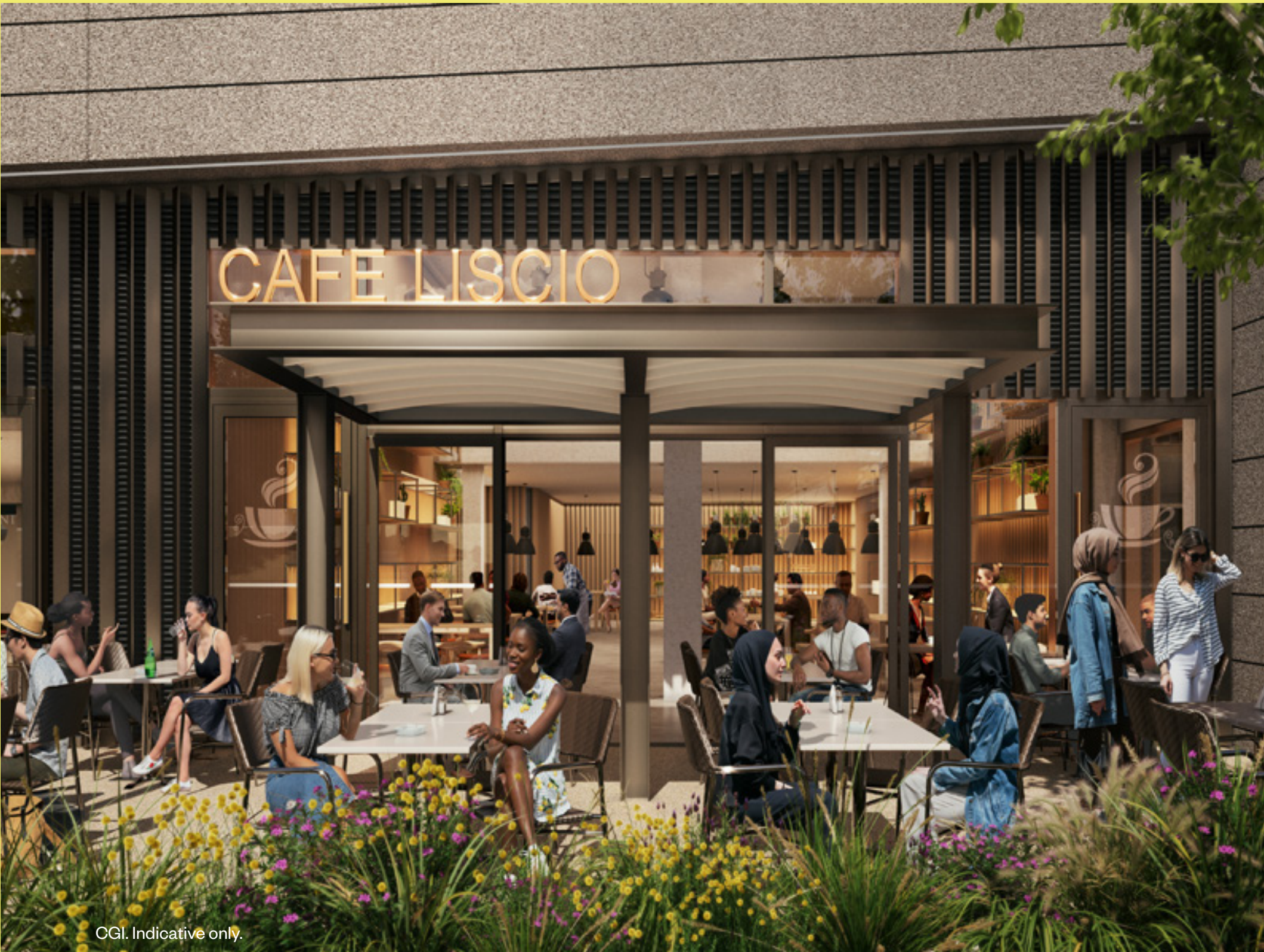
CGI. Indicative only.