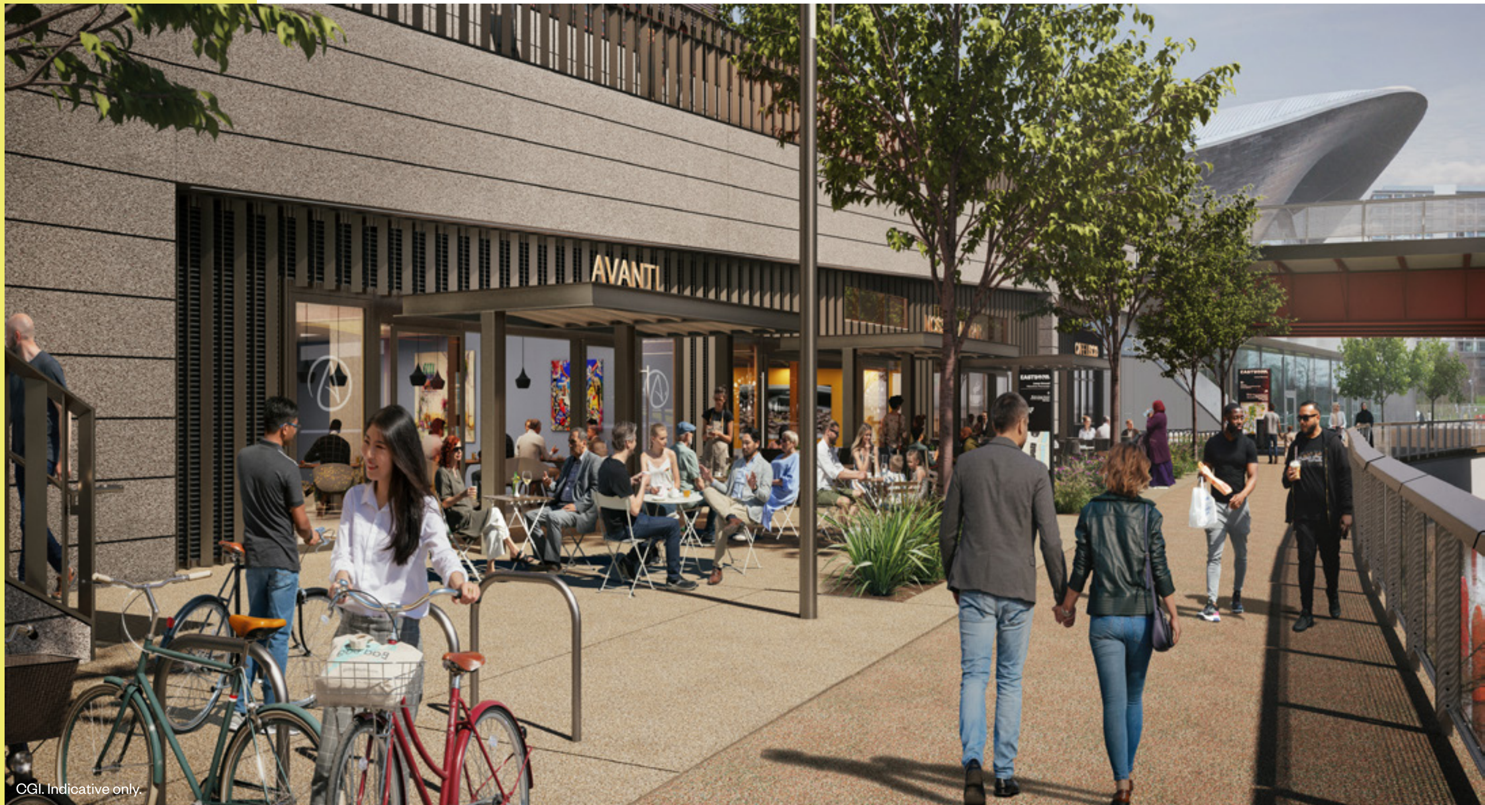
CGI. Indicative only.