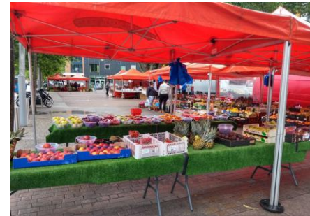
City Island / English National Ballet