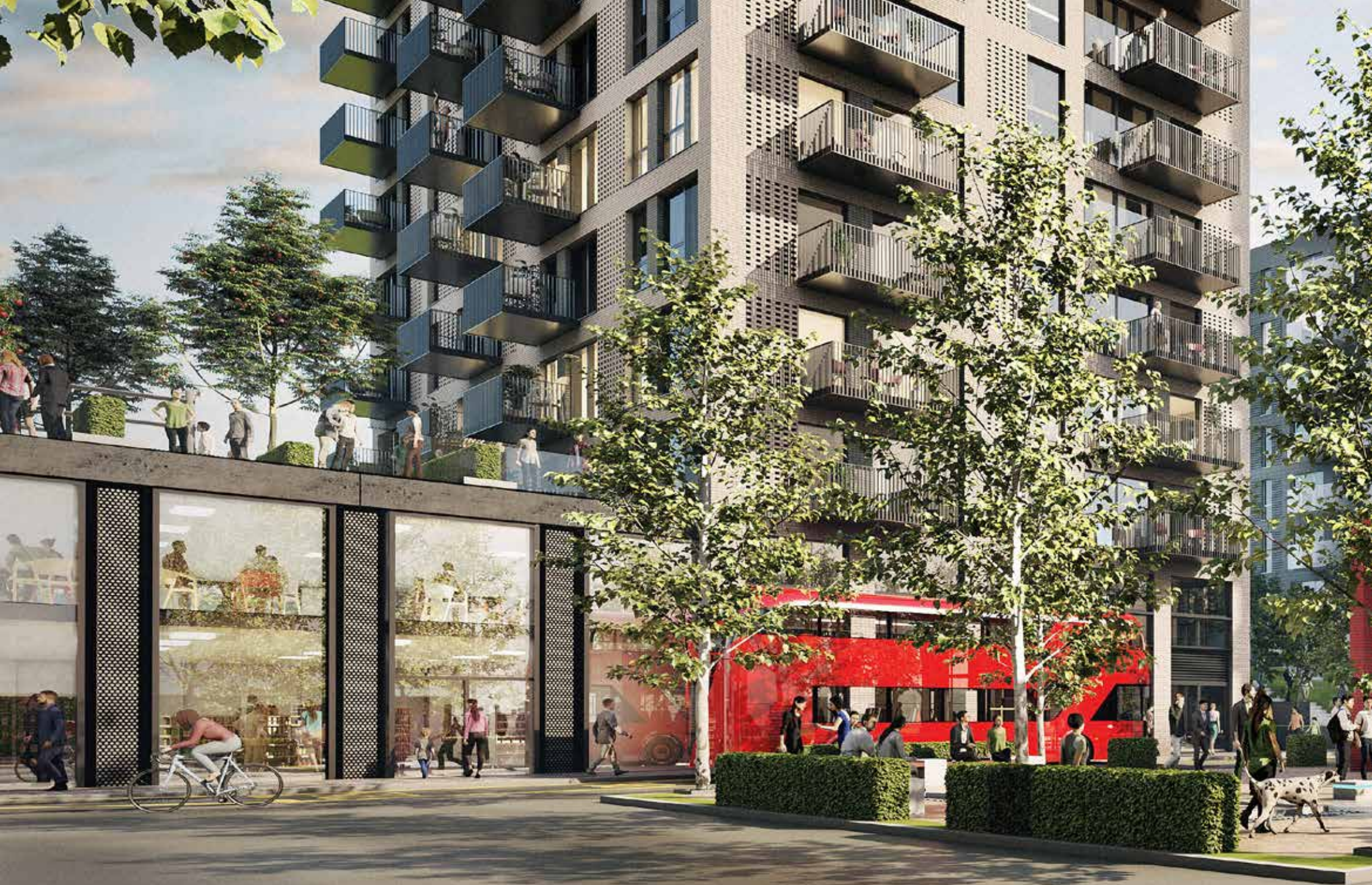
CGI of first floor office accommodation with retail below